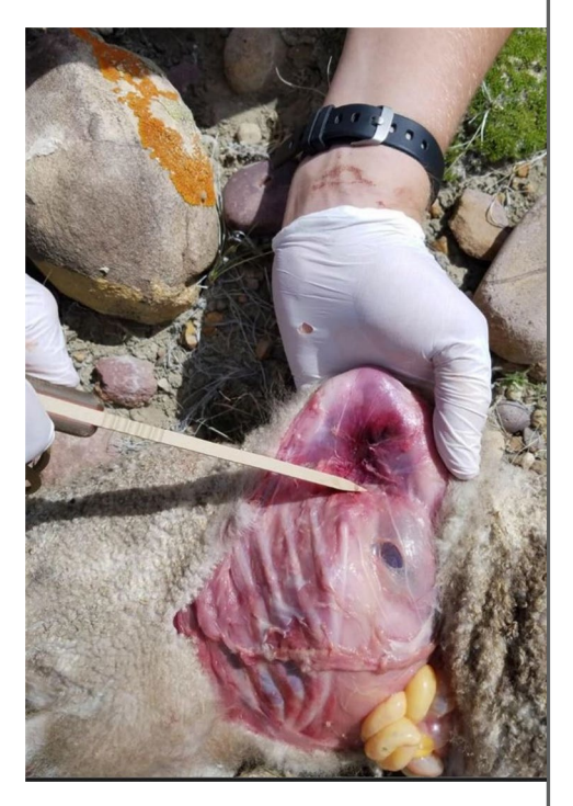
* Note: Puncture wound and bruising indicating injuries while the lamb was still alive.

Other clues include: Eagle feces, feathers, or castings around lamb kill. Plucking of wool. Ribs with eagle beak marks. Tongue eaten.